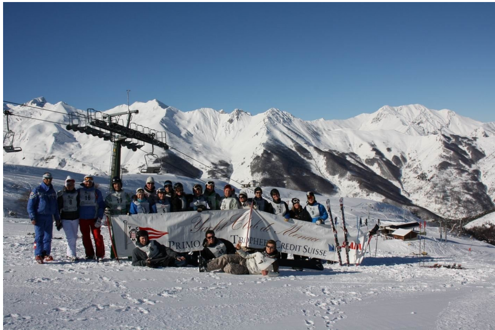
The J24 SkiCup2011 in Limone-Piemonte Italy - A great success!!