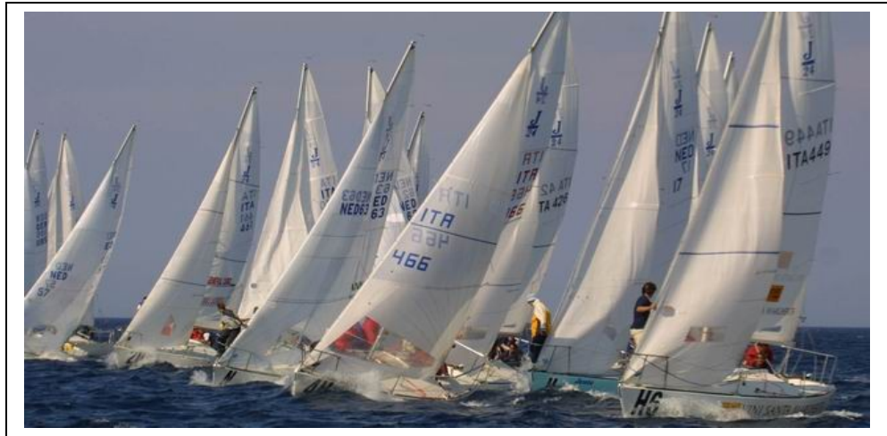
Europeans Sardinia 2003.....next Ireland 2011...and then back to Sardinia 2012!!

BGR - Bulgaria FRA - France GER - Germany GRE - Greece HUN - Hungary IRL - Ireland ITA - Italy MON - Monaco NED - Holland SLO - Slovenia SWE - Sweden SUI - Switzerland UK - England