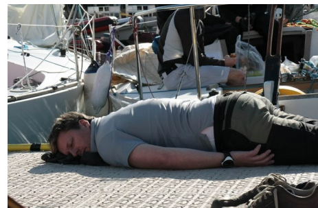
A pretty sight while waiting for wind....