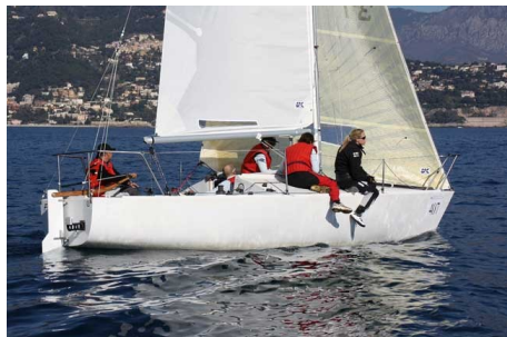
Light and shifty winds...

Main comment though - the weather was fantastic and the Skiing made up for it all!